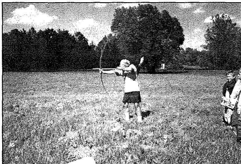
Baton Rouge Chapter's Lloyd Pine demonstrating a traditional bow.

deltachapterlasARCHAEOLOGY@att.net http://home.att.net/~deltachapterlasARCHAEOLOGY/index.html