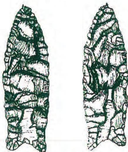
Figure 1. The obverse and reverse sides of the Ben Mayfield point (actual size).

Lanceolate shaped, with a concave base, the point is lenticular in cross-section in the hafting area and biconvex in the remaining portion. The lateral edges converge to form a moderately strong distal point that has been snapped or just broken. Toward the proximal end, the lateral edges converge gently, then run roughly parallel, expanding slightly to form rounded ears. This point measures 73 mm in length, 25 mm in width, and 8 mm at maximum thickness. The width-to-thickness ratio is approximately 3:1. However, this ratio would be closer to 5:1 if not for a step fracture that developed on one margin. Fluting occurs on both faces for about one third of the length of the point. Basal and lateral grinding occurs over one third of the total length of the point. Reduction occurring on the margins of the non-hafted portion and the truncated distal portion indicates usage.