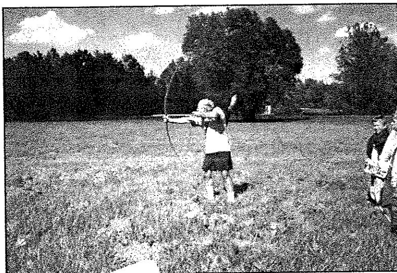
Baton Rouge Chapter's Lloyd Pine demonstrating a traditional bow.

deltachapterlasARCHAEOLOGY@att.net http://home.att.net/~deltachapterlasARCHAEOLOGY/index.html